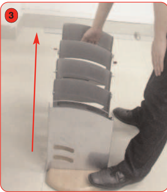
Hold the top pocket, place foot on base and lift unit gently forward and upwards.