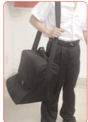
Padded carry bag with shoulder strap and handle for easy transportation