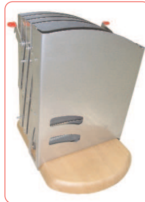
The Aura literature stand folds to a small and handy size for storage