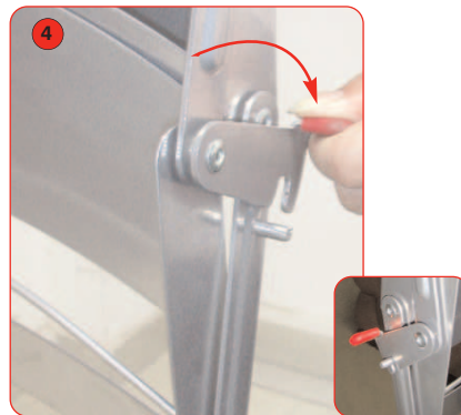
Once unit is fully extended, push the locking arm forwards and secure into place by slotting the hook over the locator pip.