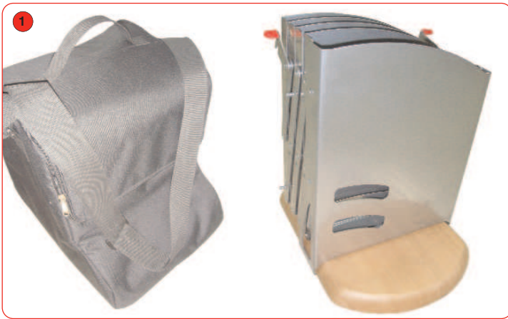
Kit Includes: Aura and carry bag

Important: Ensure fingers are kept clear of folding mechanism when opening and closing the unit