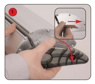
Remove one moulded end cap from the base. Slide the plastic insert from the base.