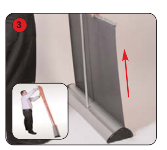
Lift the top rail to raise the graphic from the base. Lean the banner stand backwards and continue to extend the graphic.