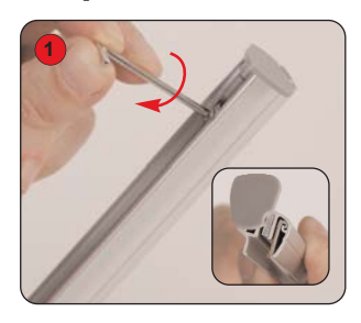
Using the Allen key stored in the base, loosen the top rail screws. Rotate the rail end cap to expose the steel flat bar.