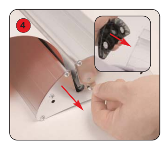
Whilst holding the graphic, remove the locking pin from the base and gently allow the graphic to retract. Re-fit the moulded end cap

WARNING: Always attach graphic to base and top rail before removing the locking pin.