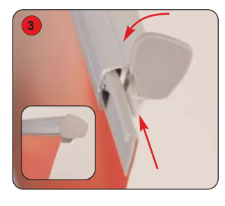
Slide the rail insert and graphic into the top rail. Close the rail end cap.