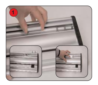
Turn the base over and open the pole retainers. Remove the pole from the base. Important: Close the pole retainers before using the banner stand.