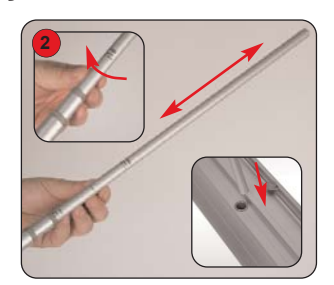
Set the telescopic pole to the desired graphic height. Twist clockwise to lock , anti-clockwise to unlock . Fit the pole into the base.