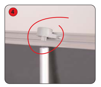
Secure the graphic into position by locating the top rail onto the pole.

Important: Hold the top rail whilst lowering the banner to prevent damage to the graphic. (do not drop)