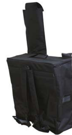
Clever Carry Bag - Rucksack Style!