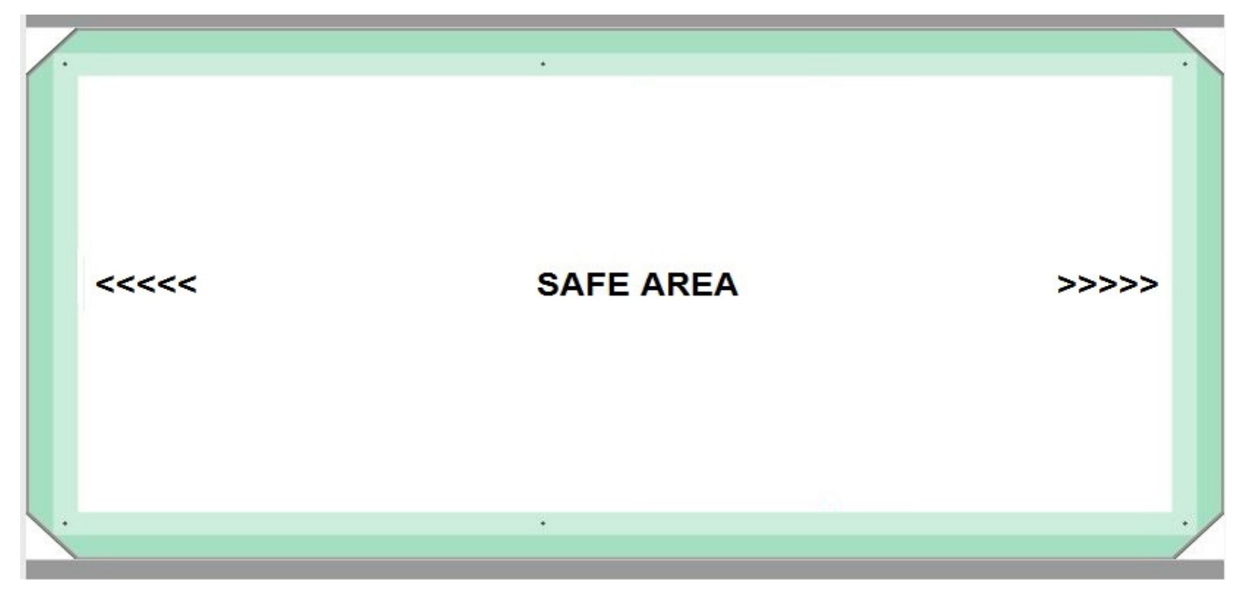
Keep all crucial details within the 'Safe Area' - then, allow overflow into the 'Bleed Area'

Please refer to Page 1 - for artwork, finer details