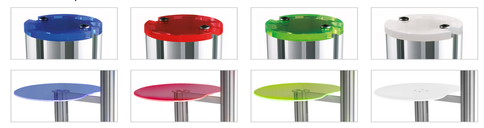
Multimedia - Simple 'Clip-Together-System'