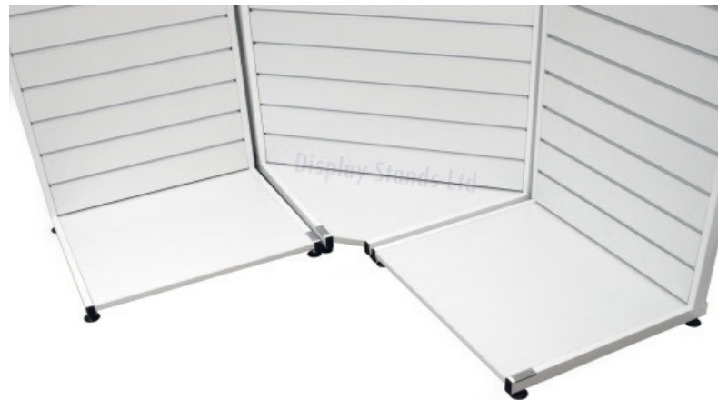
Slatwall - Combination